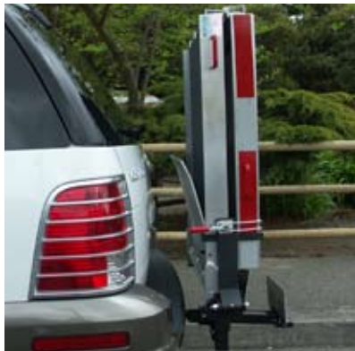
Folds into a compact unit