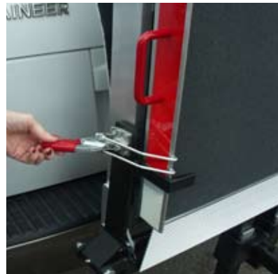
Locking latch assures a rattle-free ride