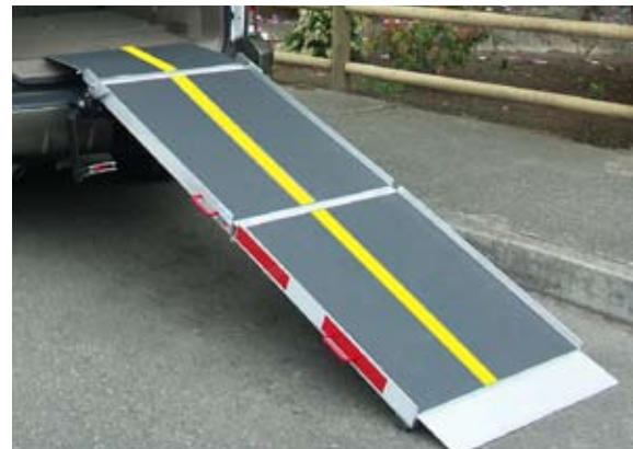
Extends to 8' length and features side rail safety reflectors

Bariatric weight capacity = 800 lbs. or greater