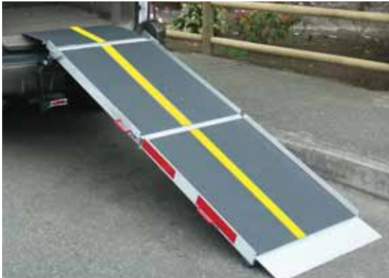
Extends to 8' length and features side rail safety reflectors

Bariatric weight capacity = 800 lbs. or greater