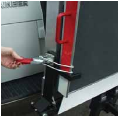
Locking latch assures a rattle-free ride