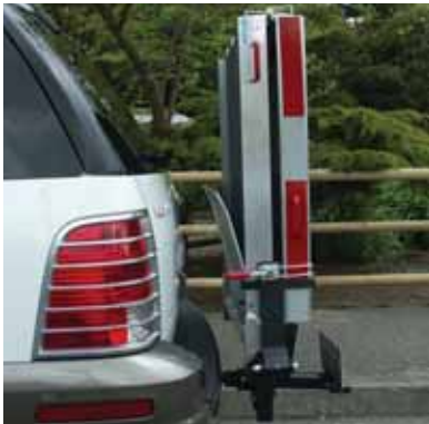
Folds into a compact unit