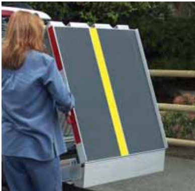
Spring assisted hinge